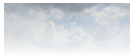
20 percent solar radiation